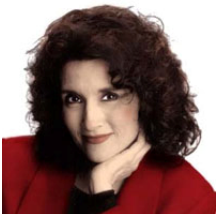
Marilyn vos Savant is married to Dr. Robert Jarvik, inventor of the artificial heart